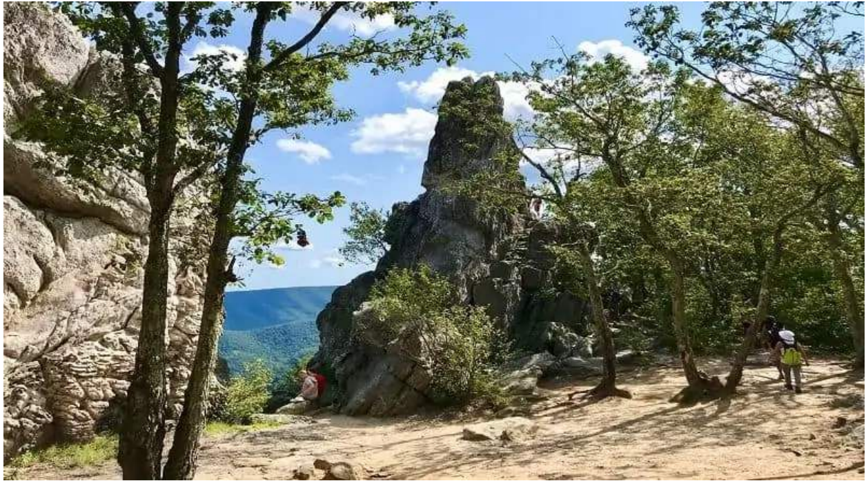
Dragon's Tooth in Catawba

September brings cooler mornings and prime conditions for challenging hikes. These trails kick off Virginia's best hiking season.