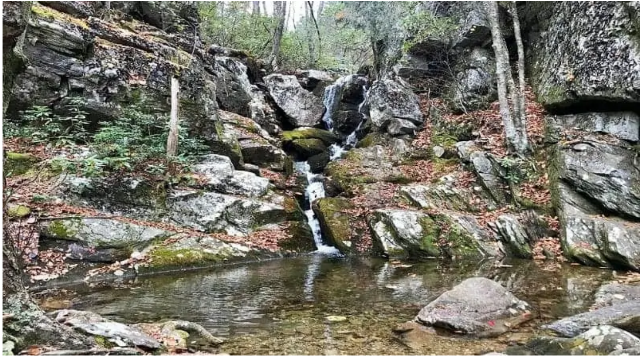
White Rock Falls in Waynesboro

December hikes are about reflection, solitude, and year-end views. These trails offer rewarding scenery without long commitments.