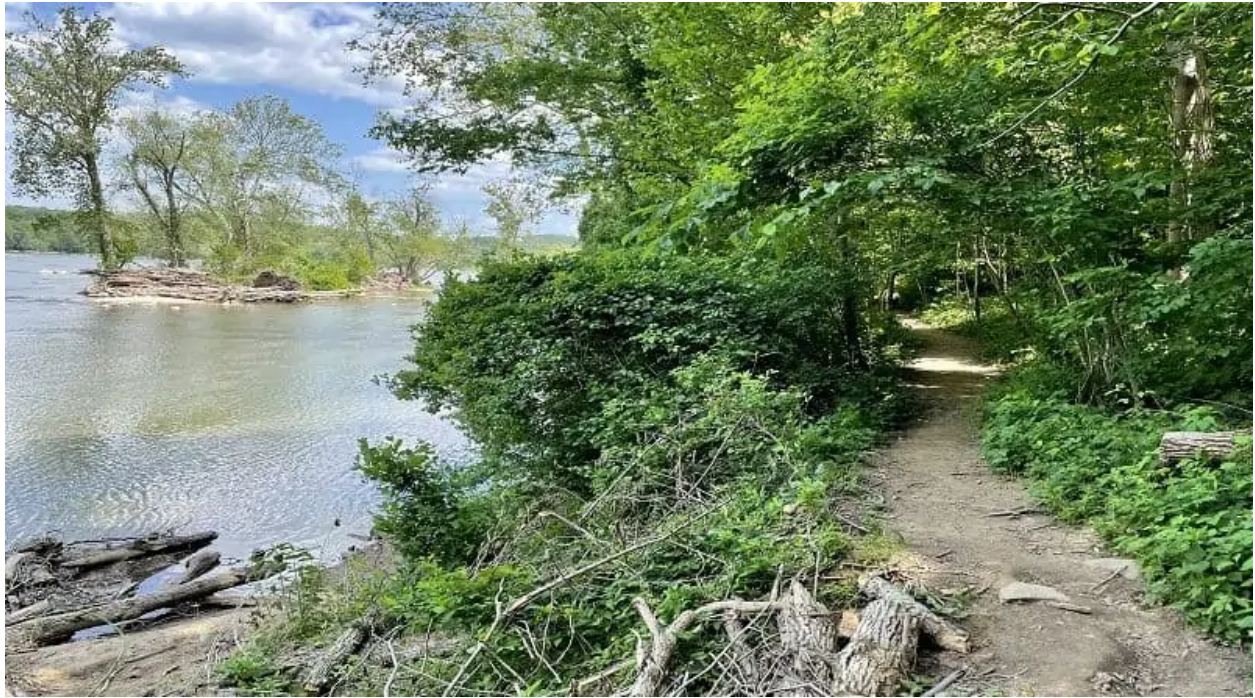
Turkey Run Park in McLean

June hiking favors shaded trails, water features, and unique landscapes. These hikes balance summer conditions with memorable scenery.