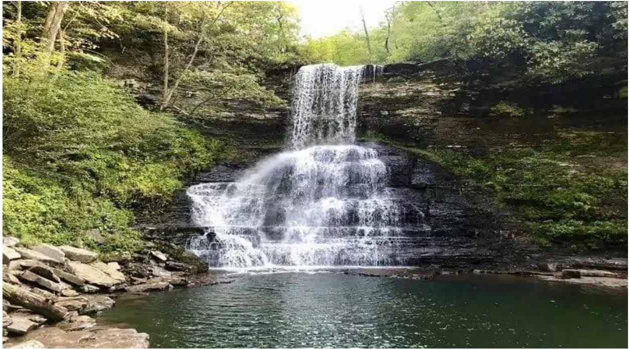
Cascades Falls in Pembroke

April is peak spring hiking season in Virginia, with waterfalls at their strongest and forests bursting into green. These hikes showcase spring scenery across the state.