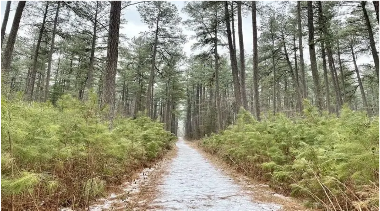
Conway Robinson State Forest in Gainesville

January hikes focus on lower elevations, shorter distances, and trails that shine even in cold weather. These are confidence-building hikes that prove Virginia hiking doesn't stop in winter.