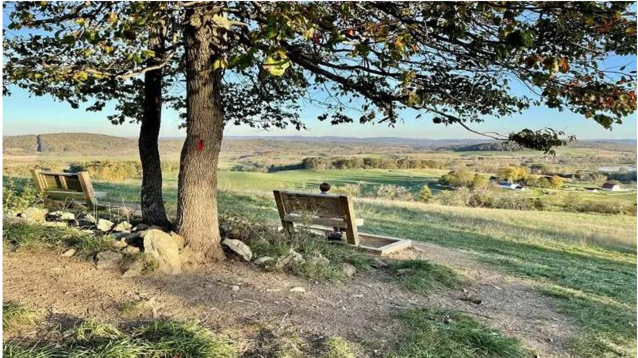
Lower Piedmont Overlook at Sky Meadows State Park in Delaplane

August is all about water, wildlife, and coastal or high-elevation escapes. These hikes are summer-friendly and unforgettable.