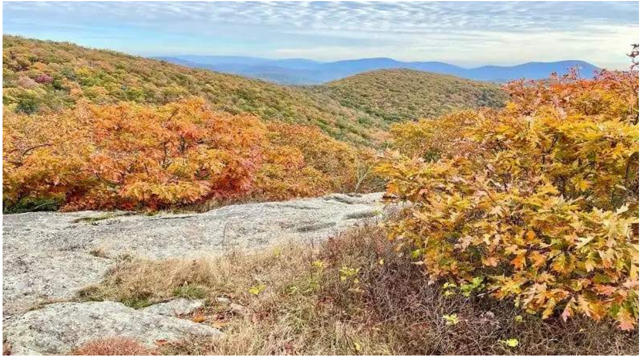
Spy Rock in Montebello

October is Virginia hiking at its finest, with peak foliage and crisp mountain air. These hikes deliver iconic fall color and sweeping views.