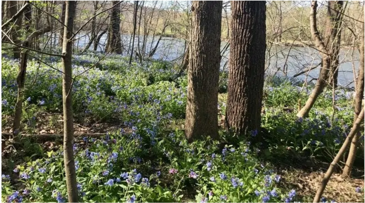
Bluebell Trail at Shenandoah River State Park in Bentonville

March marks the transition into spring, with flowing waterfalls and early blooms. These hikes reward hikers eager to stretch their legs after winter.