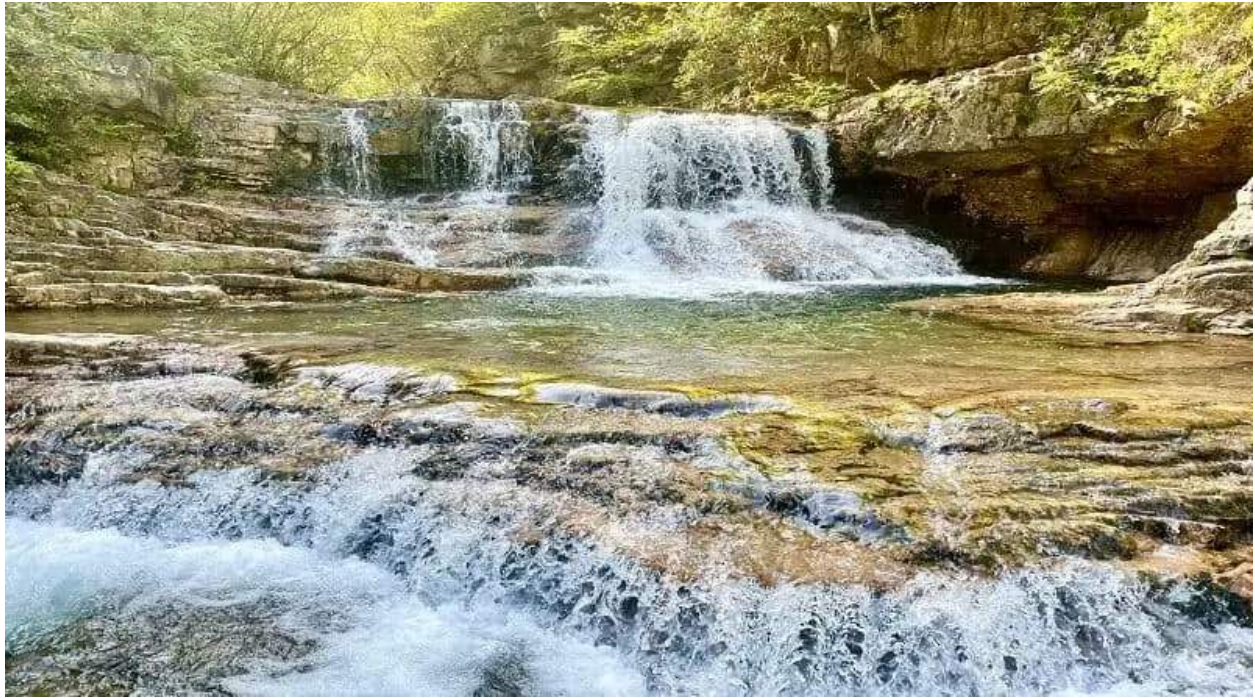
St. Mary's Falls in Vesuvius

July hikes focus on higher elevations, waterfalls, and shaded routes to beat the heat. These trails deliver classic summer rewards.