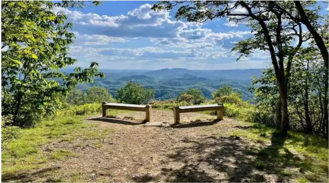
Molly's Knob at Hungry Mother State Park in Marion

May brings ideal hiking weather, longer days, and lush mountain landscapes. These trails are made for lingering views and adventurous outings.